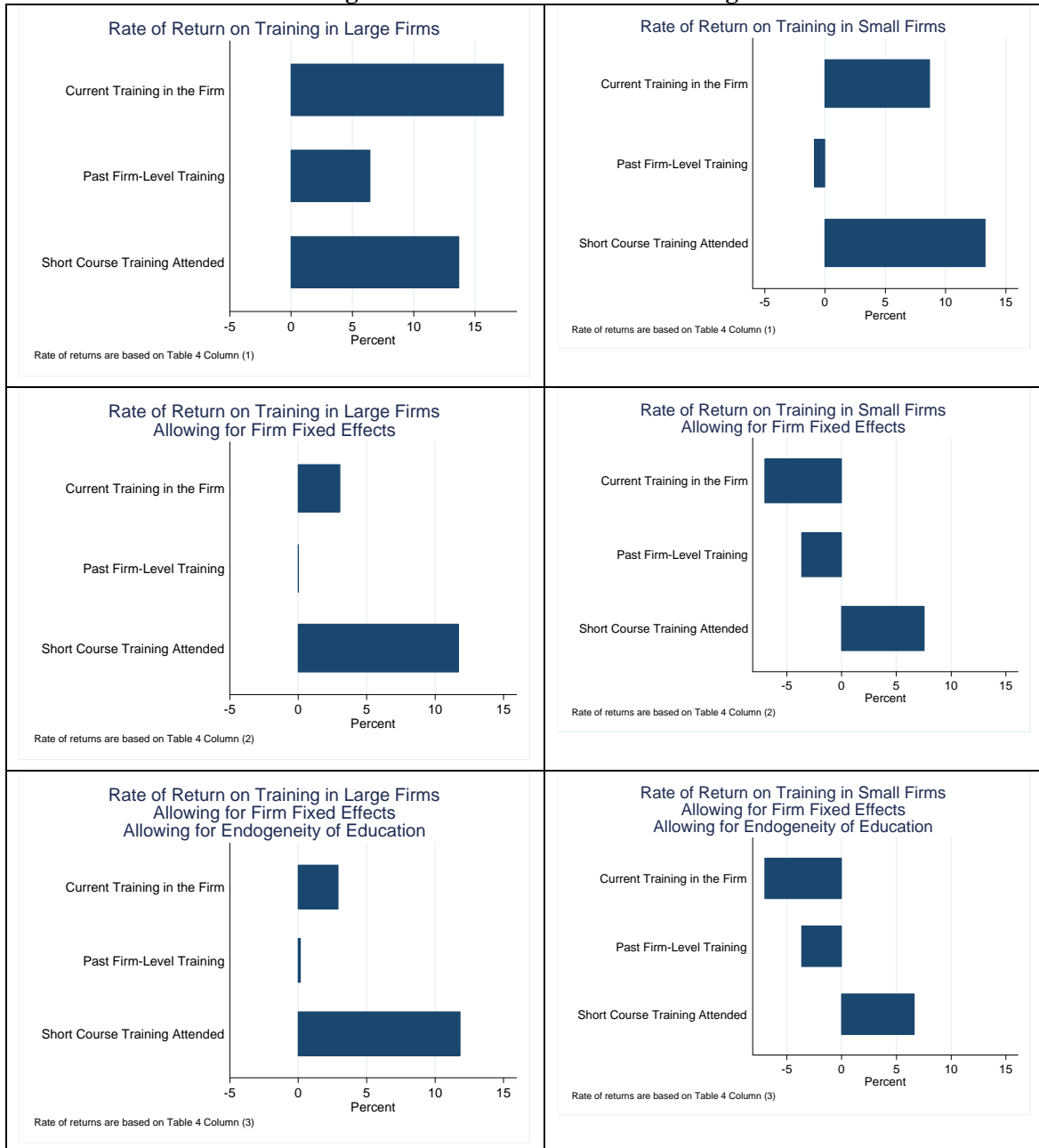
Figure 3 Rates of Return on Training

Among small firms there is a substantial return to current training and attending a short training course and nothing for past training. Firm size is clearly of importance for these returns as return